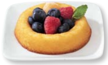
Whole Eggs | Super Whip Egg Whites Sugared Yolks | Egg Yolks