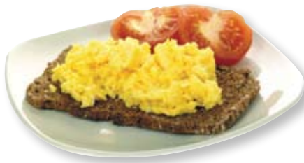
Original | Butter Flavor Buttermilk Blend ESL® Light and Fluffy Texture ESL®