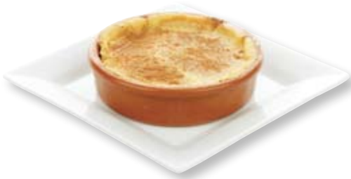
Frozen Egg Product with Citric Acid Liquid Egg Product with Citric Acid ESL®