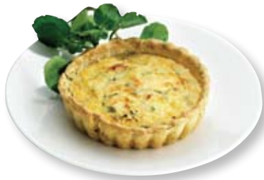
Low Sodium Sunny Fresh Free® – no fat, no cholesterol Egg Whites